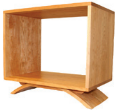
#3346 Covington Night Stand 19 x 24 x 23