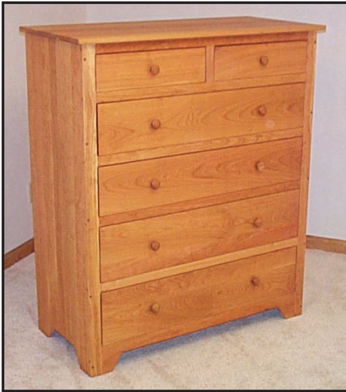
# 3112 Amish High Chest 21 x 45 x 51