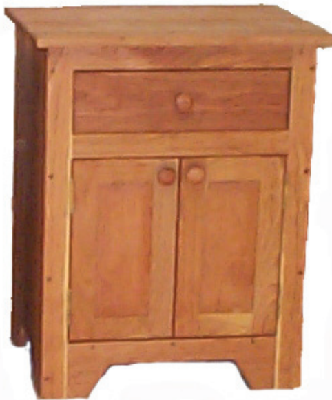
#3133 Amish Night Stand 18 x 23 x 30