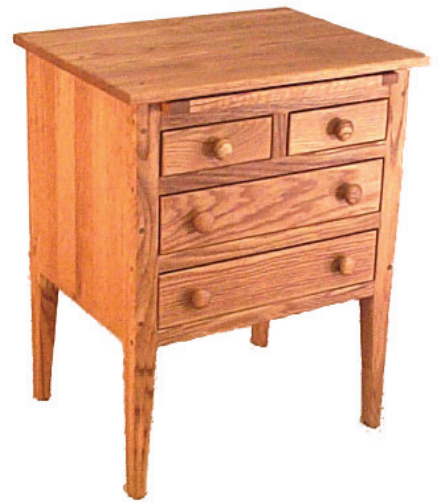
##3135 Candle Night Stand 18 x 24 x 32