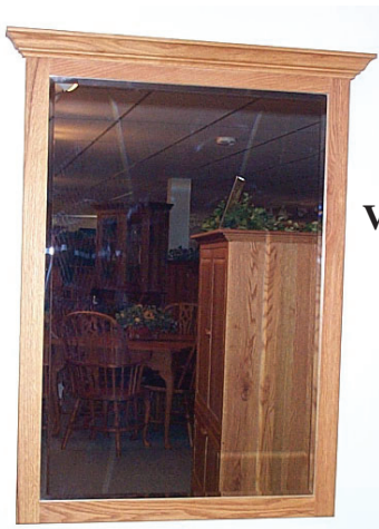
# 3503 Vertical Amish Mirror 32 x 43