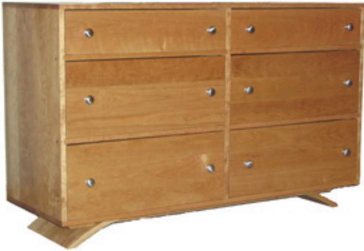
#3345 Covington Dresser 20 x 54 x 34