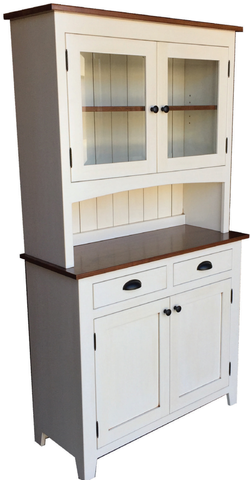
# 2013 Bontrager Upper 13 x 36 x 38