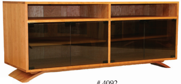
# 4092 Covington Entertainment Base 20 x 55 x 24