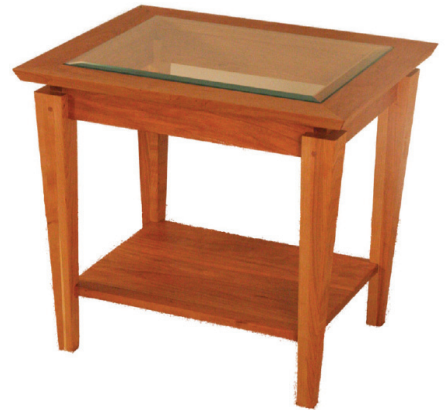
# 5052 Corydon End Table w/Beveled Glass Top 22 x 26 x 26