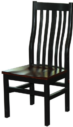
#1420F-5 Summerfield 5 Spindle Side 20 x 19 x 44