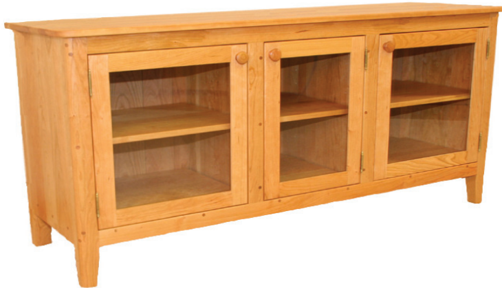
# 2123 Legacy Plasma Stand 18 x 60 x 30