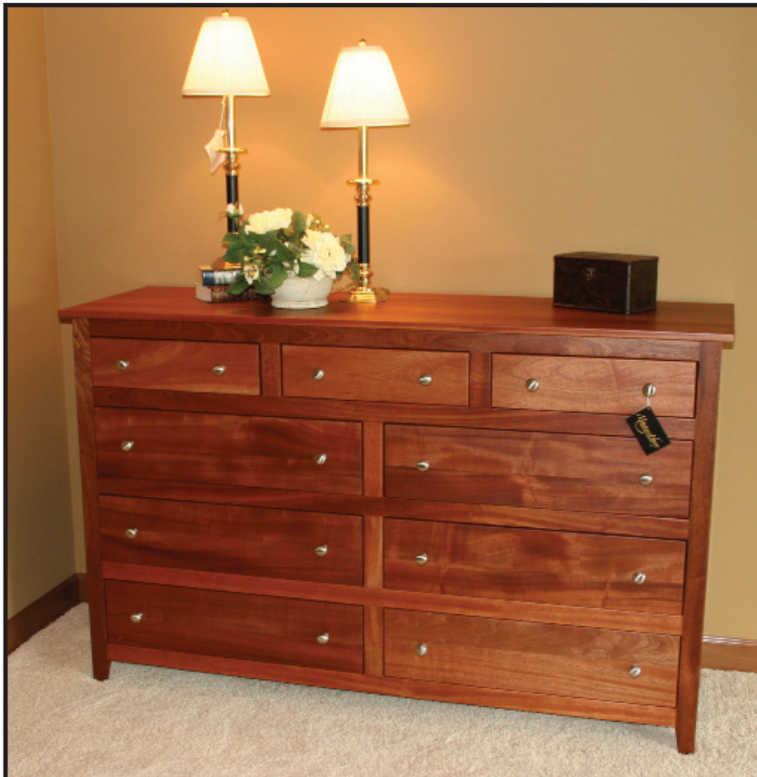
# 3104 Dutch Dresser 21 x 66 x 42