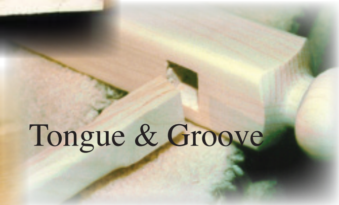
Tongue & Groove