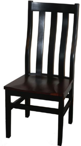
#1421F-3 Summerfield 3 Spindle Arm 25 x 19 x 44