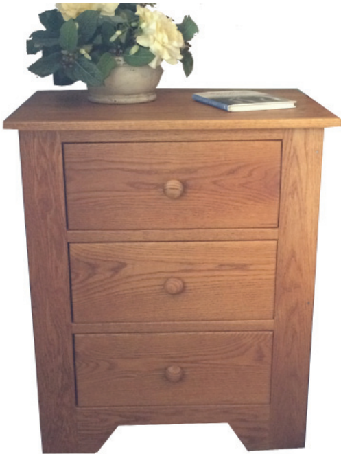
# 3115 Small Chest w/3 drawers 18 x 24 x 30