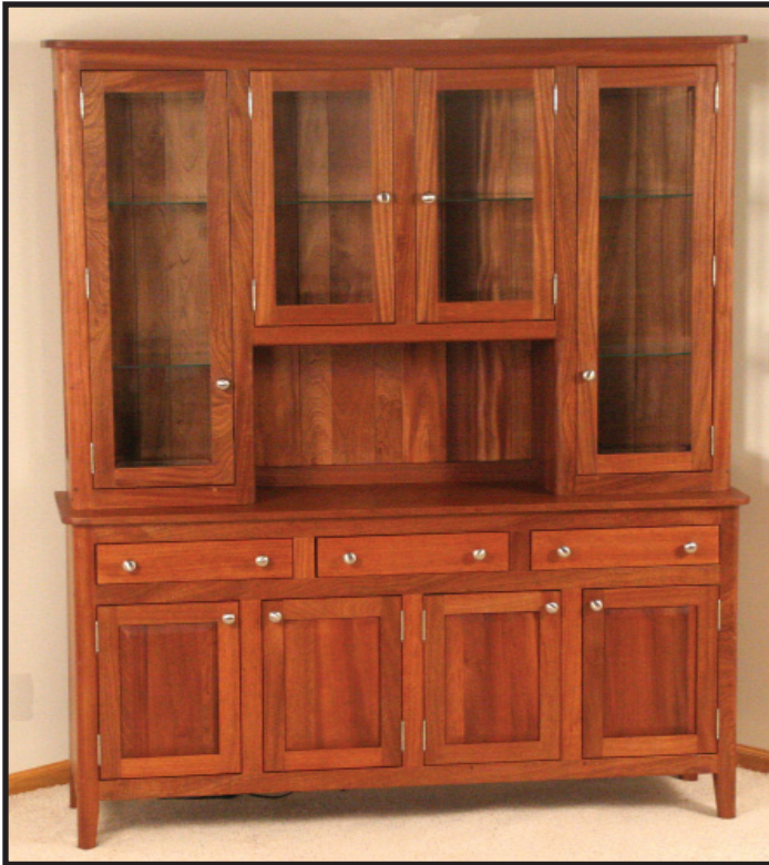
# 2054 Legacy Hutch Upper w/Lights & Glass Shelves 13 x 65 x 45