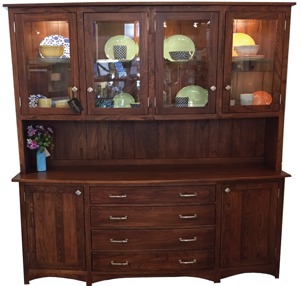
# 2151 Cambridge Hutch Upper w/Lights & Glass Shelves 17 x 69 x 47