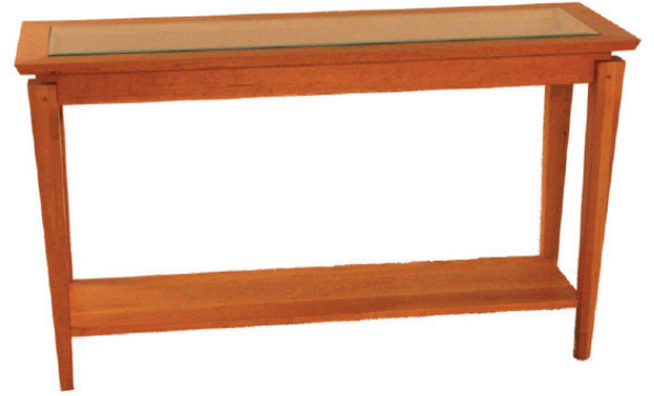
# 5054 Corydon Sofa Table w/Beveled Glass Top 18 x 54 x 29