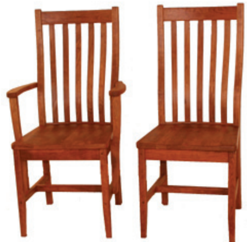
# 1466 Springfield Side Chair 17 x 18 x 38