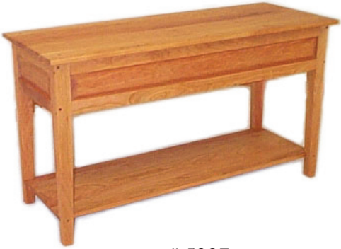
# 5027 Vintage Sofa Table 18 x 48 x 30