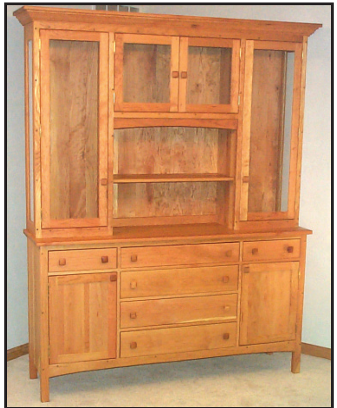
# 2122 Mission Buffet 18 x 69 x 37