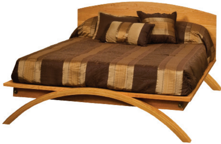
#3050 Covington Queen Bed 68 x 89 x 41