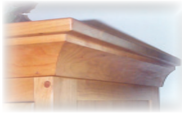
Standard For All Mission Cove Molding