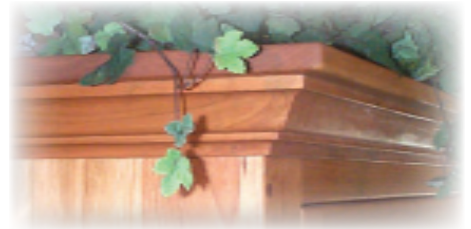
Standard Crown Molding