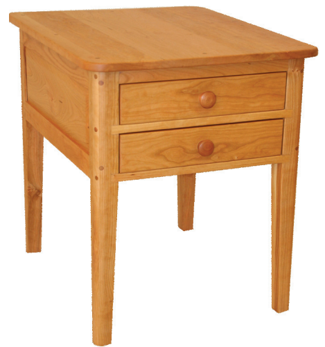
# 5026 Vintage End Table 22 x 26 x 26