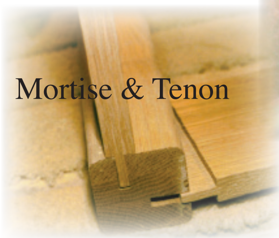
Mortise & Tenon