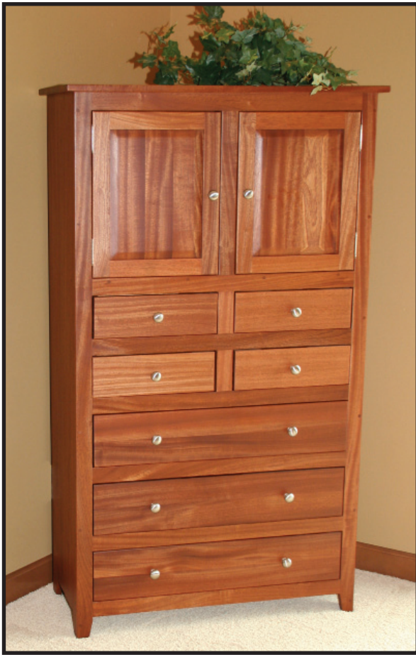
# 3120 Hochstetler Chest 17 x 38 x 66