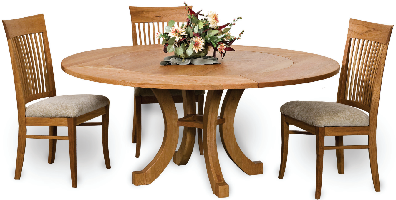
#1025 Stanford 48" Table w/leaf storage cabinet 48 x 48 x 30