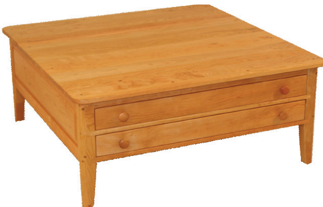
# 5025 Vintage Coffee Table 40 x 40 x 18