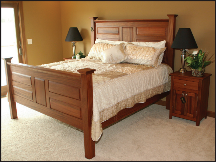
#3073 King - 84 x 91 x 65