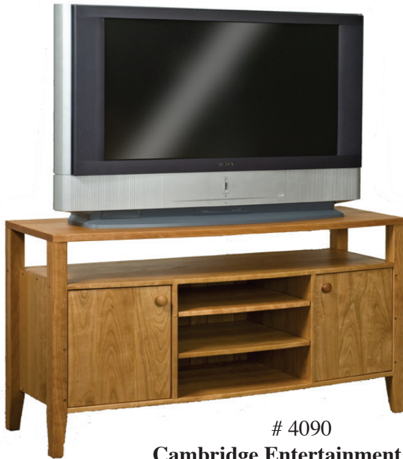
# 4090 Cambridge Entertainment Base 18 x 52 x 31