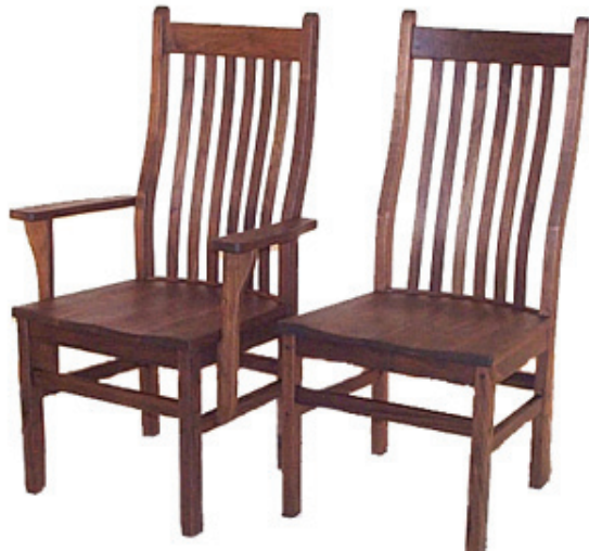
#1421 Summerfield Arm 25 x 19 x 44