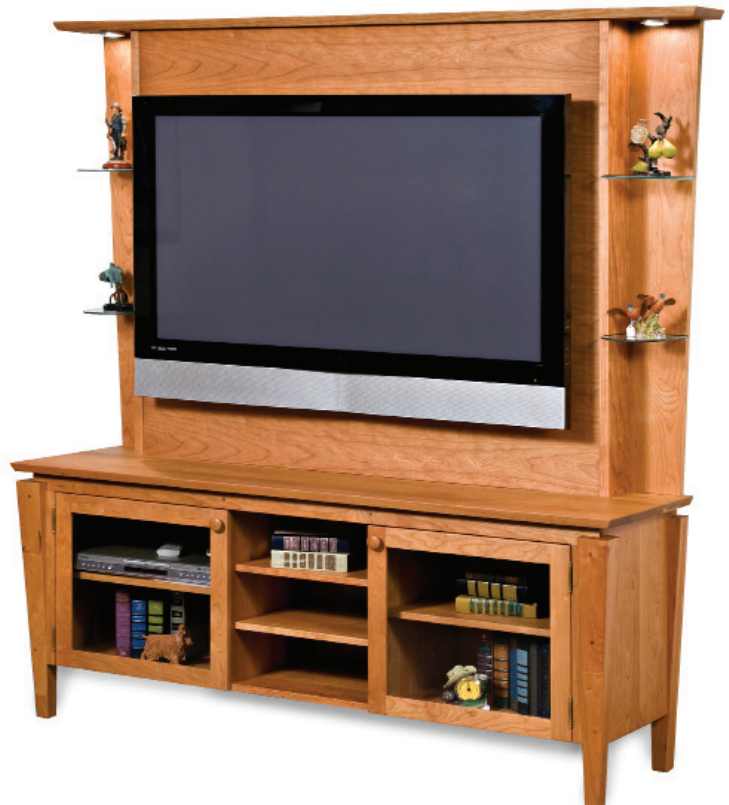
#4084 Corydon Entertainment Upper 8 x 72 x 49