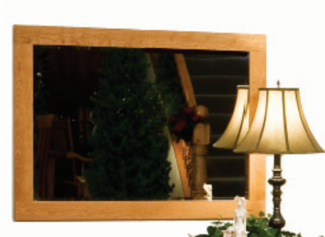
#3504 Covington Mirror 43 x 31