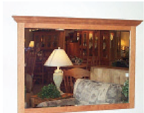
# 3502 Horizontal Amish Mirror 43 x 32