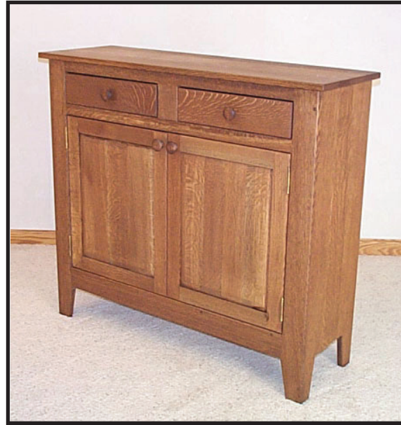
# 2110 Keepers Chest 14 x 42 x 37