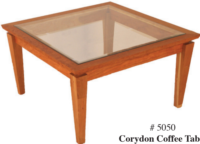
# 5050 Corydon Coffee Table w/Beveled Glass Top 36 x 36 x 18